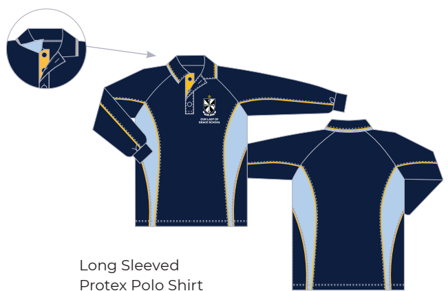
Long Sleeved Protex Polo Shirt