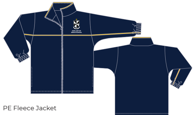
PE Fleece Jacket