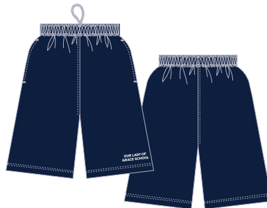
Unisex Protex Shorts