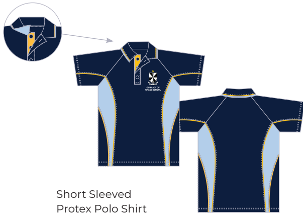
Short Sleeved Protex Polo Shirt