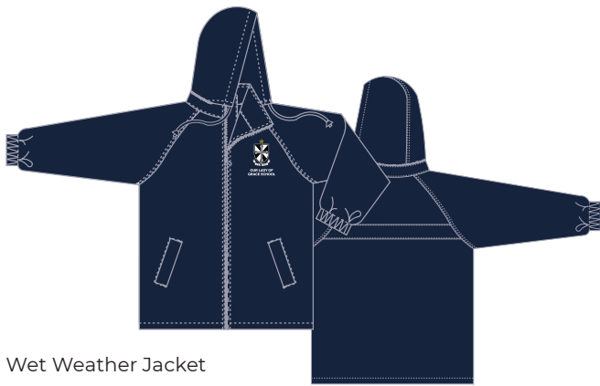
Wet Weather Jacket