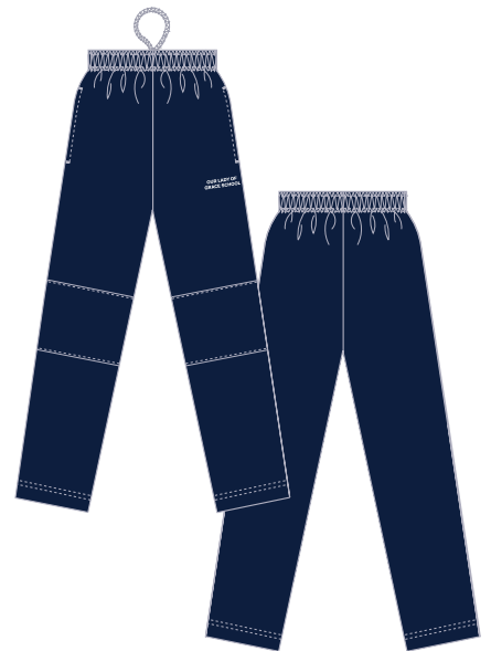
PE Fleece Trackpant