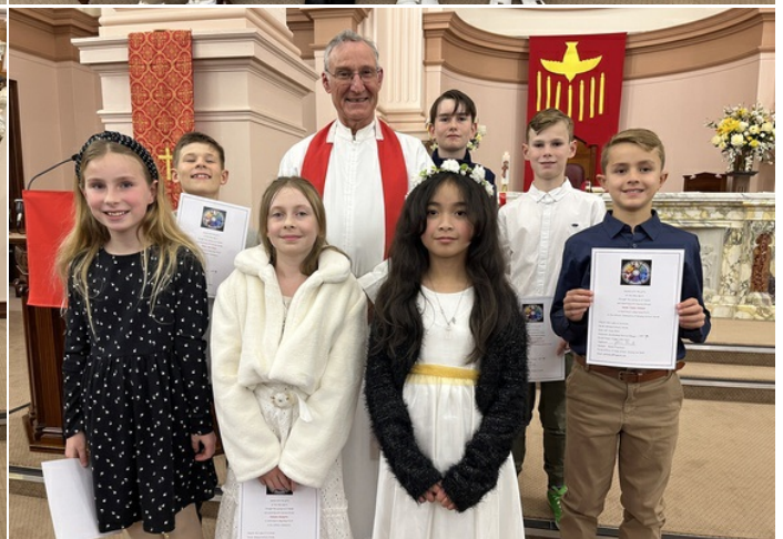
Year 5/6 Mass St Peter and St Paul

Last Thursday was our final mass for the term. The Year 5/6's celebrated the Feast Day of Saint Peter and Saint Paul